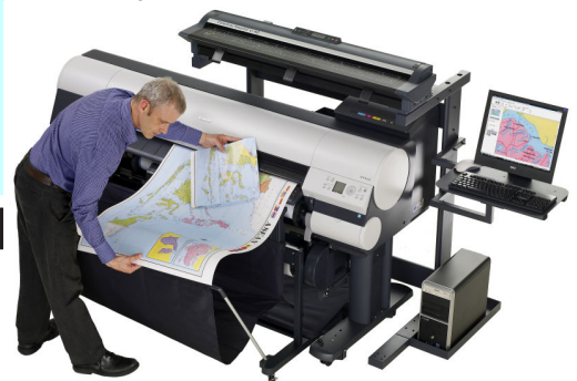
Universal Repro Stand with PC / flat screen mounting.

(Colortrac Approved Software Products). Third party software from leading independent software vendors.