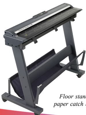
Floor stand with paper catch basket